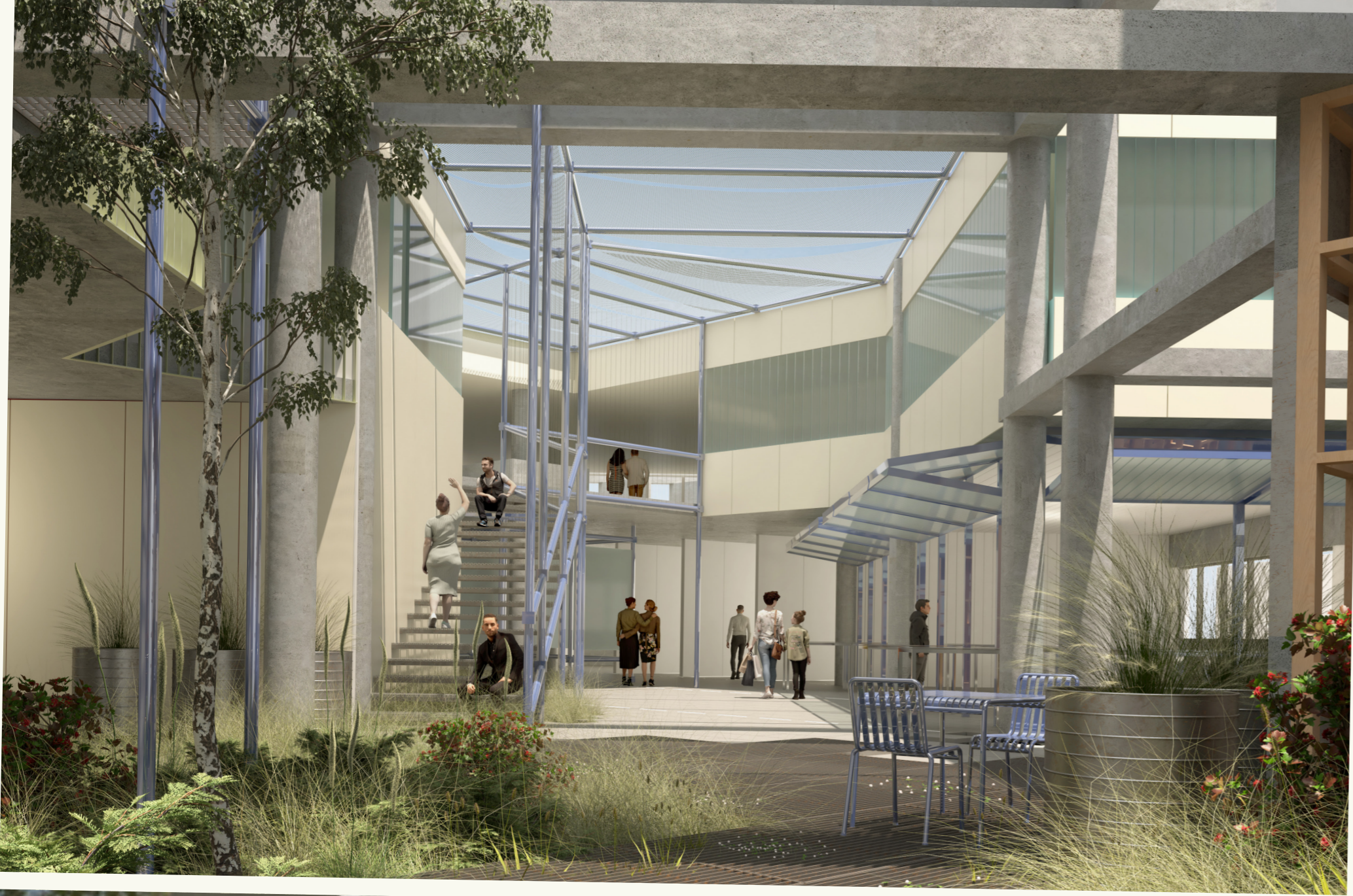
Open Atrium Area with Stair

'Re-Place' uses the former MMBW building as an opportunity to transform an existing building into a vibrant community hub that addresses the LBC principles. The design of the building splits the existing area into two distinct spaces, connected by a central foyer and amenities core.